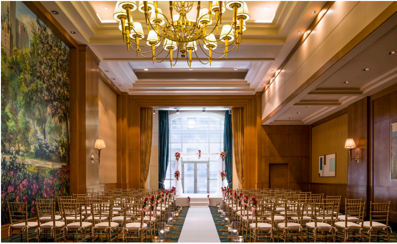
Le Grand Paris Ballroom