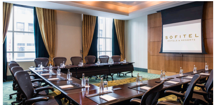
Montmartre Meeting Room